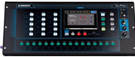
Qu-16 / Qu-24 / Qu-32 / Qu-Pac / Qu-SB