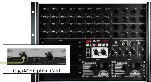
GigaACE Option Card