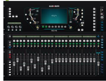
SQ-5 / SQ-6