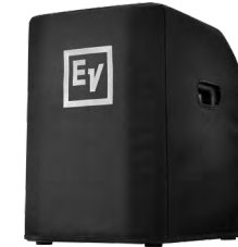
SUB COVER Sold separately