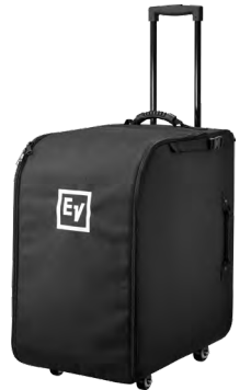
ROLLING SUB CASE Sold separately