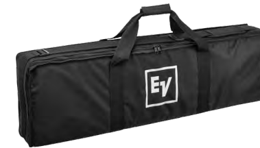
SHOULDER BAG Included with system

The EVOLVE 50 system includes a super-durable shoulder bag to transport and protect the array and the pole, with additional storage space for cables and other items. A matching subwoofer cover is available as an optional accessory, with openings to access the handles. A robust rolling sub case is also available, equipped with four heavy duty casters, hardened sides, a retractable main handle, three additional fabric handles, and straps to attach the shoulder bag. Each features an embroidered EV logo.