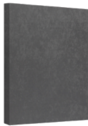
Flat Panel 60.4 M1 FS