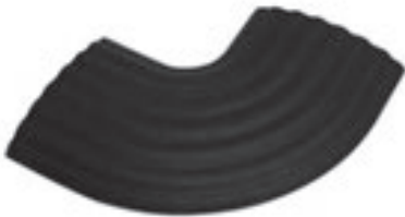
DEFENDER OFFICE 90° curve