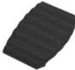
DEFENDER OFFICE End ramp