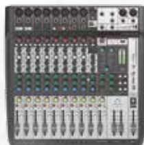
Signature 12 MULTI-TRACK

Also available: Signature Series Multi-track versions with multi-channel ultra-low latency USB audio interface -