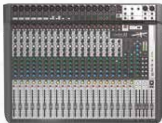
Signature 22 MULTI-TRACK

Soundcraft, Harman International Industries Ltd., Cranborne House, Cranborne Road, Potters Bar, Hertfordshire EN6 3JN, UK T: +44 (0)1707 665000 F: +44 (0)1707 660742 E: soundcraft@harman.com Soundcraft USA, 8500 Balboa Boulevard, Northridge, CA 91329, USA T: +1-818-893-8411 F: +1-818-920-3208 E: soundcraft-usa@harman.com