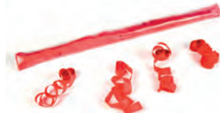
REF: S10- 10m x 1.5cm