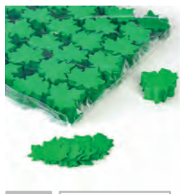
REF: HJ- TREE LEAVES