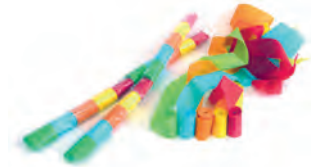
REF: S10S- 10m x 5cm