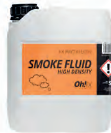
REF: LIQ-H HD5 HIGH SMOKE