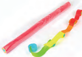
REF: S13- 13m x 2.5cm