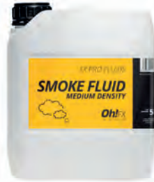
REF: LIQ-H MD5 MEDIUM SMOKE