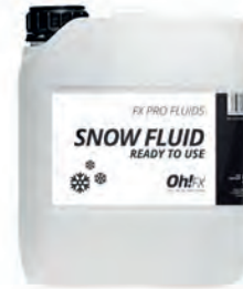
REF: LIQ-N RTU5 SNOW FLUID