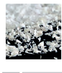
REF: NEU1 SNOW