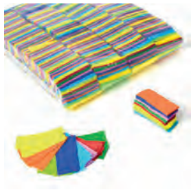
REF: REC- RECTANGULAR

Tissue paper Metallic Fluo Laser Biodegradable