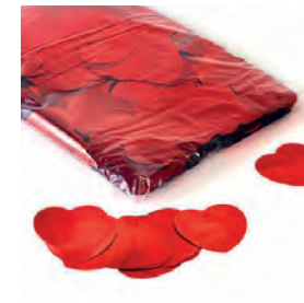
REF: CO- HEARTS