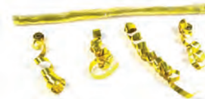
REF: S10/M- 10m x 1.5cm