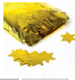
REF: ES- STARS