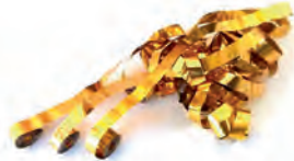
REF: S5/M- 5m x 0.85cm