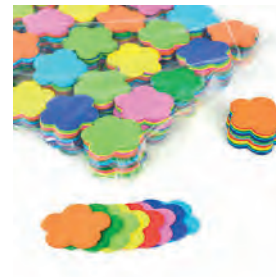
REF: FL- FLOWERS