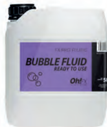
REF: LIQ-B RTU5 BUBBLE FLUID