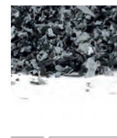
REF: CEN-2 ASH