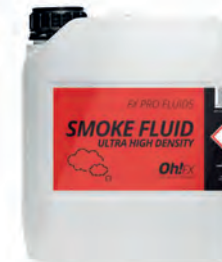
REF: LIQ-H 2HD5 ULTRA SMOKE