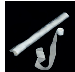
REF: S20- 20m x 5cm