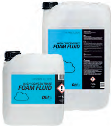
REF: FFDC-5 / 25 FOAM FLUID