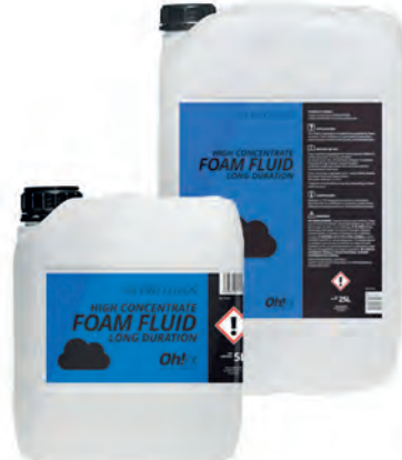
REF: FFP-5 / 25 FOAM FLUID LONG LAST