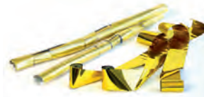
REF: S15/M- 15m x 5cm