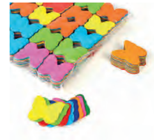
REF: MA- BUTTERFLIES