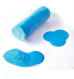
REF: R55- ROUND