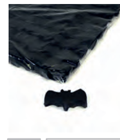
REF: MU- BAT