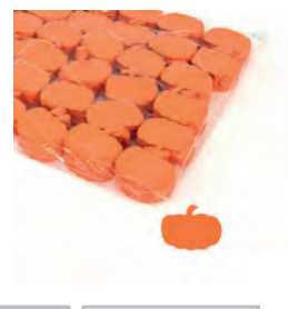
REF: CA- PUMPKIN