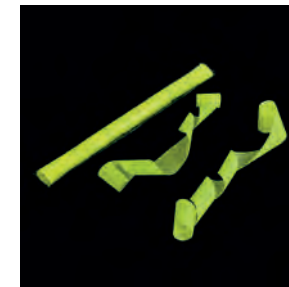
REF: S15/F- 15m x 5cm