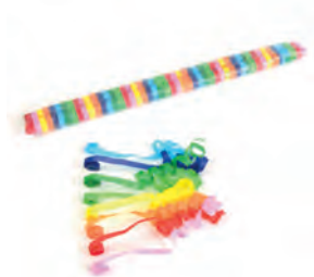
REF: S5- 5m x 0.85cm