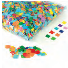
REF: Q17- SQUARE