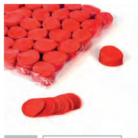
REF: PE- ROSE PETALS