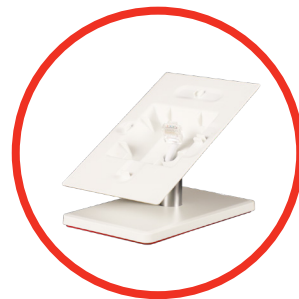
TEC-X-TM Table mount

Biamp and Tesira are either trademarks or registered trademarks of Biamp Systems, LLC in the United States and other countries. Other product names referenced may be trademarks or registered marks of their respective owners and Biamp Systems is not affiliated with or sponsored by these companies.