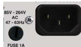
Fig 4-11: PS-AMP IEC Power Plug & Fuse.

The fuse socket is a where the anti-surge fuse 1A 20 x 5mm fuse is inserted. Please unplug the unit whenever opening this cover.