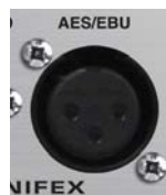
Fig 2-8 PS-SEND AES/EBU Input.

The signals on this connector should meet the IEC 60968 specification