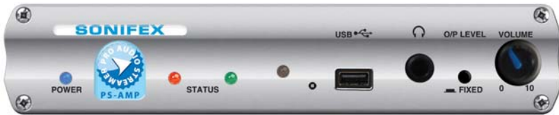
Fig 4-1: PS-AMP Front Panel.

The PS-AMP is a freestanding unit which converts an IP audio stream directly to speaker outputs. It is also available in a 1U rack-mount as the PS-AMPS. The PS-AMP has the same feature-set as the PS-PLAY except that there are no individual audio outputs other than the speaker terminals. The PS-AMP uses an integrated 2 x 15W D-class amplifier to deliver audio directly to a pair of connected speakers.