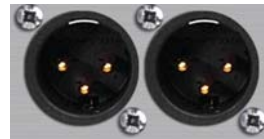
Fig 3-8: PS-PLAY Analogue Outputs