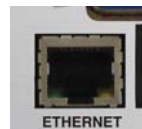
Fig 2-12: PS-SEND ETHERNET Port.