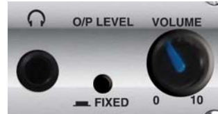
Fig 3-6: PS-PLAY Headphone Socket, Volume Control & Output Level Control.

The headphone output has its own volume control and has a maximum output level of +12dBu.