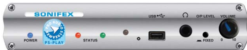
Fig 3-1: PS-PLAY Front Panel.

The rear panel has 2 x RJ45 connectors, one for the 10/100Mbit Ethernet interface and one for GPIO connections. The PS-PLAY has 2 output relay contacts which can be triggered remotely over IP from a connected PS-SEND unit. There is a 9 way D-type RS232 serial connection for control of the unit by automation systems and for firmware updates. The unit can be remote controlled via serial connection, TCP or UDP and remote management of the unit is also possible using SNMP traps.