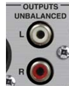
Fig 3-9: PS-PLAY RCA Phono Analogue Outputs.